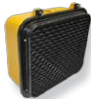
16" Vantage Visor (sold separately)