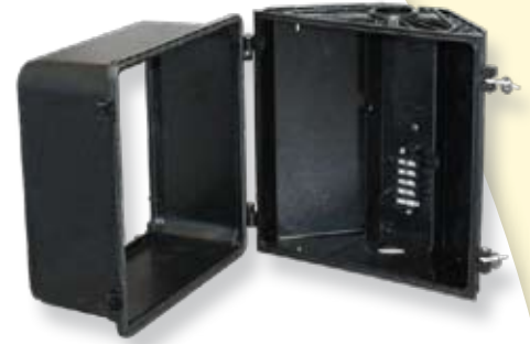
12 inch housing shown in black

Cabinets Controllers Signals Signs Software Specialty