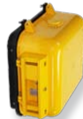
16" Clamshell mount (sold separately)

*Dimensions are approximate and vary based on material used