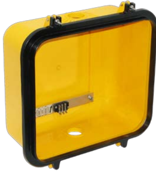
16 inch housing shown in Federal yellow

12" Housing 16" Housing Aluminum Polycarbonate