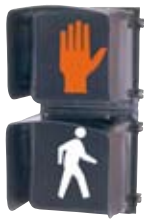
12" 2-section with tunnel visors